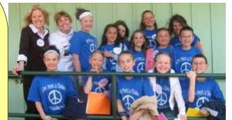
Project YES served 334 youth, 140 parents and 122 families .

75% of the Project YES youth stated that "participating in this program helped improve my relationships with my family members." In the schools, there was a 39% decrease in discipline referrals.