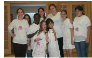
CFY Girl Power Club

444 counseling clients attended 1,761 appointments this year.