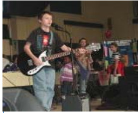
"Somebody Like You" by John Shanks and Keith Urban.

We gratefully accept donations! Credit cards are accepted and a donation form can be accessed at www.centerforprevention.org . We TRULY appreciate your support!