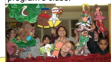
CFY youth present a puppet show

87% of parents participating in the Strengthening Families Program (SFP) reported increased knowledge of effective communication and disciplinary skills; 80% of youth involved in SFP stated they had increased their life skills; and 60% of families stated that they started to hold regular family meetings.