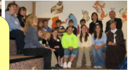
"What's Your Anti-Drug?" Winners honored by the Sussex County Municipal Alliances

98% of Asset Building participants stated that the interactive activities broadened their knowledge of assets.