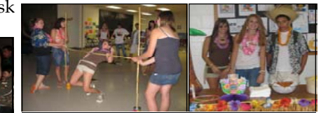
Attendees at DEFY’s recruitment luau at the Sussex County YMCA.