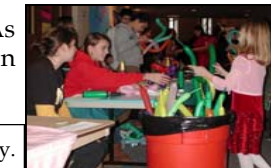
At right: DEFY hosts a table with fun activities during Red Ribbon Day.

DEFY members also developed, scripted, and filmed 3 PSAs addressing underage drinking which are posted on YouTube and are aired on SCCC’s educational TV station.